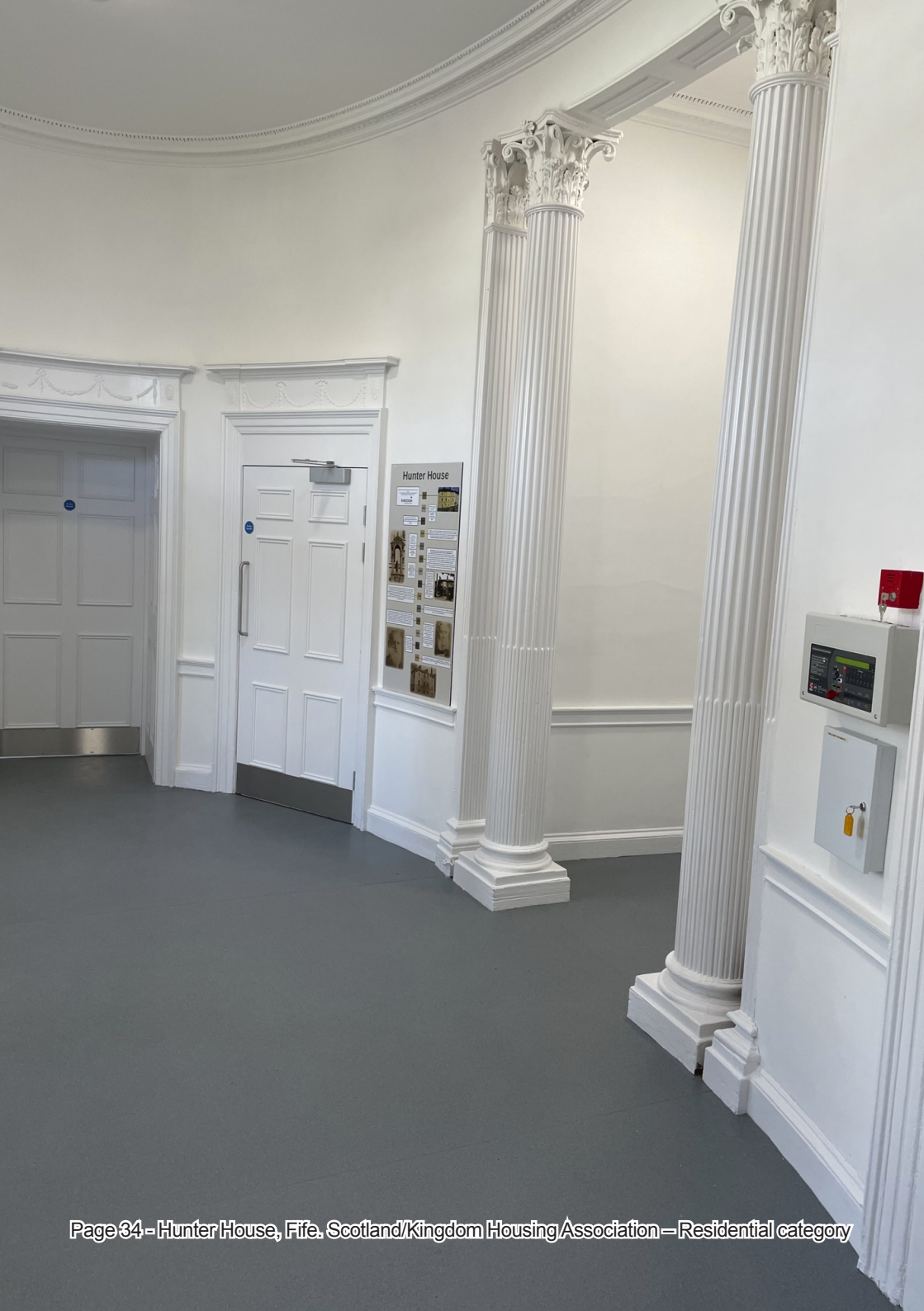
Page 34 - Hunter House, Fife, Scotland/Kingdom Housing Association – Residential category