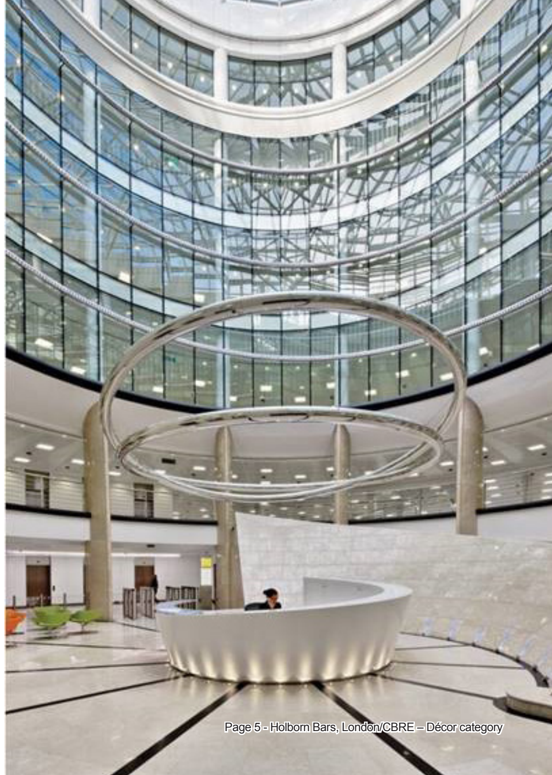
Page 5 - Holborn Bars, London/CBRE – Décor category