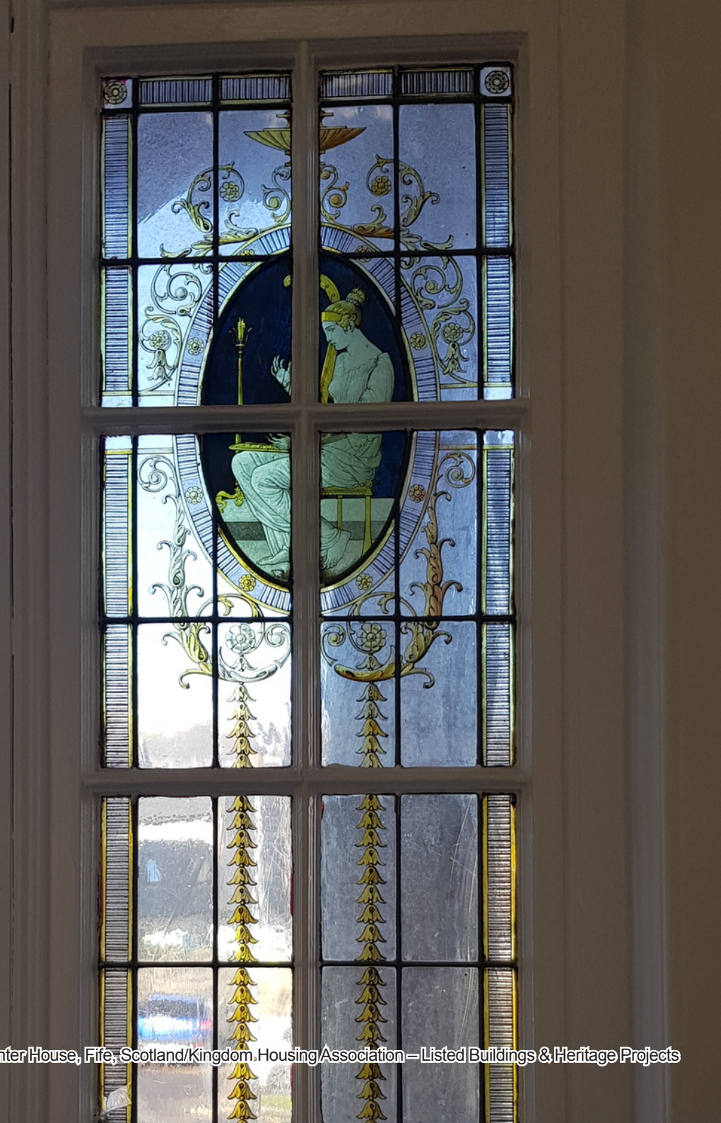
Hunter House, Fife, Scotland/Kingdom Housing Association – Listed Buildings & Heritage Projects