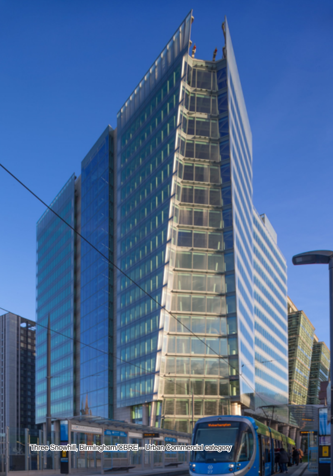
Three Snowhill, Birmingham/CBRE – Urban Commercial category