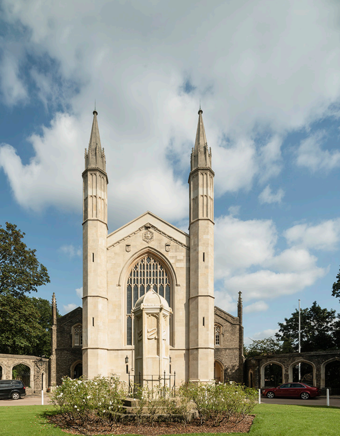
The Danish Church, London/C.F.Møller Architects – Public Buildings